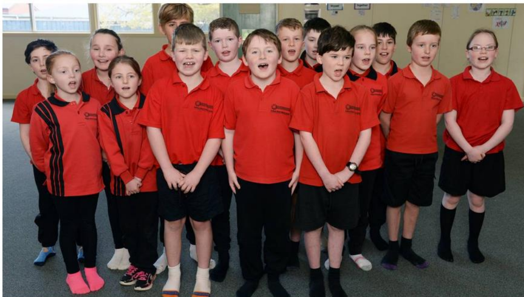
IN FINE VOICE: Ballarat North Primary School's grade 3/4C pupils practice Let It Play for the upcoming Music: Count Us In performance.